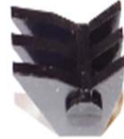
Top view of jaws